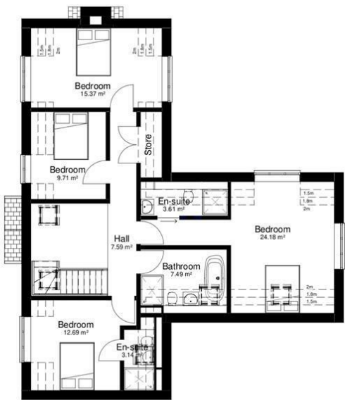
Dwelling 2_GA First Floor 1 : 100