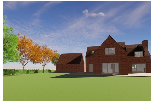
The Maple Leaf Beoley Lane, B98 9BA